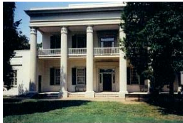
Home of President Andrew Jackson Show Choir Performance

Saturday, April 24: (B-L-D) 7:00 a.m. Cont. Breakfast @ Fairfield Inn 9:00 – 11:30 a.m. Tour: The Hermitage