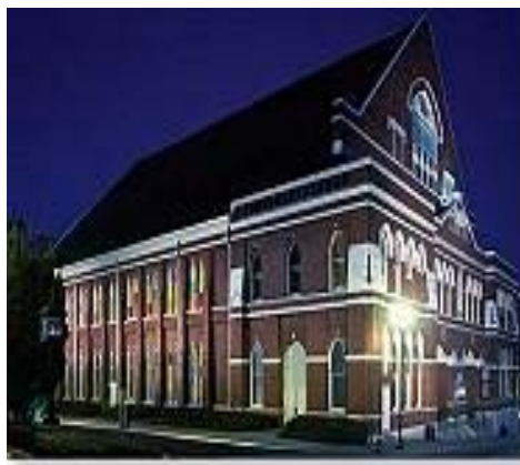
The Ryman Auditorium

Sunday, April 25: (B-L-D) 7:00 a.m. Cont. Breakfast @ Fairfield Inn 8:30 – 11:30 a.m. Step-on Guided Tour *Highlights of Nashville 12:00 – 2:00 p.m. Lunch @ Wildhorse Saloon *Country Line-Dance Lessons 2:00 – 3:00 p.m. Explore & Shop Downtown Nashville 3:15 p.m. Return to Hotel 6:00 – 9:00 p.m. General Jackson Cruise, Dinner & Show @ The Gazebo Entrance *Show Choir Performance Monday, April 26: (B) 6:30 a.m. Cont. Breakfast @ Fairfield Inn 7:30 a.m. Depart for Highlands HS 5:00 p.m.(Approx.) Arrival at Highlands HS